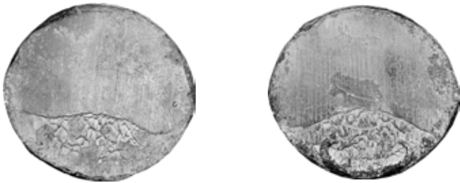
Work pieces sheared off with a mechanical bar stop: in the lower area breakouts and shingles are clearly visible, on the right work piece the characteristic known as „Dali's moustache“ is clearly visible.“

The primary objective of the new development, to achieve a significant improvement in the quality of shearing surfaces, was clearly met. The servo hydraulic bar stop ensures an excellent shear pattern due to the Moog Servo Valve's sensitive and dynamic control capability. The shearing surfaces are now almost parallel, and the breakouts and shingles are frequently reduced from 20% to an average of 1%.