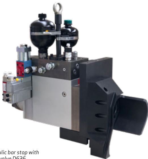
Servo hydraulic bar stop with Moog servo valve D636

Swiss machine builder Hatebur Umformmaschinen AG, a manufacturer of high-end horizontal multi-stage presses, recently completed the development of its innovative servo-hydraulic bar stop. The bar stop optimizes the shearing process for hot presses, and increases the quality of cut-offs to the extent that the reworking process has now been rendered largely unnecessary. It has also significantly reduced the consumption of materials. Moog's D636 Servo Valve is the central motion control element of the bar stop. Thanks to its robust design and highly dynamic digital control, the valve offers the best solution for use on this demanding application.