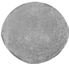
Work piece front surface without breakout, produced with servo-hydraulic bar stop (© 2019 Hatebur All Rights Reserved)

Reworking is no longer such a necessity, and material consumption is now lower, as the quantity of material required can be significantly reduced. Since less material has to be heated, energy costs are also reduced as are overall handling costs. Machine downtime is now less frequent as the bar stop can be readjusted during production if necessary. Both process reliability and the quality of the finished forged parts have increased. All these advantages, which are only slightly noticeable for the individual part, but multiplied by the approx. 14 to 30 million parts that are usually produced annually on the hot presses, the cost and time savings add up to a significant amount.