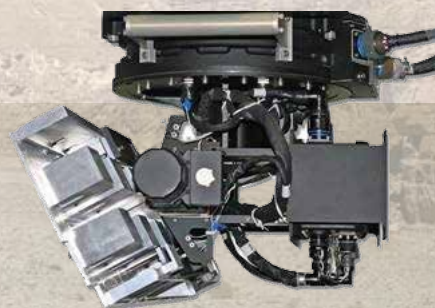
TWO-AXIS AIRBORNE GIMBAL WITH INTEGRAL SERVO ELECTRONICS