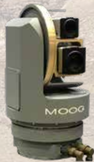
TWO-AXIS DIRECT DRIVE GIMBAL WITH INTEGRAL SERVO ELECTRONICS