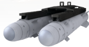
MOOG'S LIGHTWEIGHT DUAL RAIL LAUNCHER (DRL) WITH HELLFIRE INTERFACE UNIT [46 LBS.]