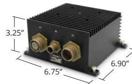
ENHANCED STORES MANAGEMENT COMPUTER (E-SMC) [4.1 LBS.]

See the extensive SMS weapon options supported by Moog at www.moog.com/sms .