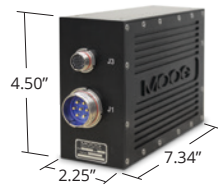
STORES INTERFACE UNIT (SIU) [3.5 LBS.]