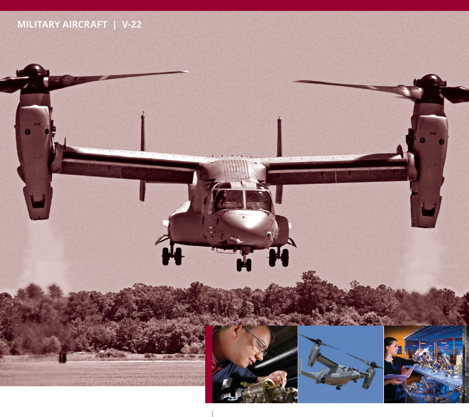
V-22 SUSTAINMENT SERVICES