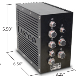
STORES MANAGEMENT COMPUTER (SMC) [4.16 LBS.]

See the extensive SMS weapon options supported by Moog at www.moog.com/sms .