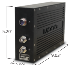
ON SCREEN DISPLAY (OSD) [2.8 LBS.]