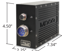
STORES INTERFACE UNIT (SIU) [3.5 LBS.]