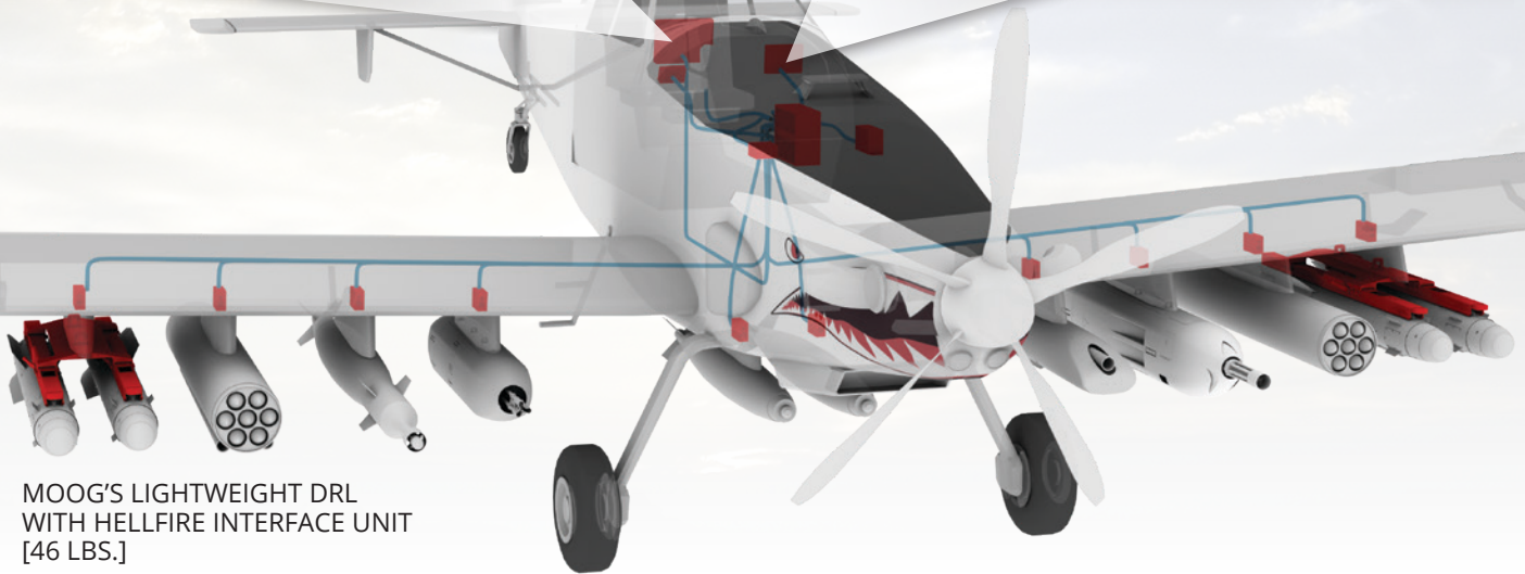
MOOG'S LIGHTWEIGHT DRL WITH HELLFIRE INTERFACE UNIT [46 LBS.]